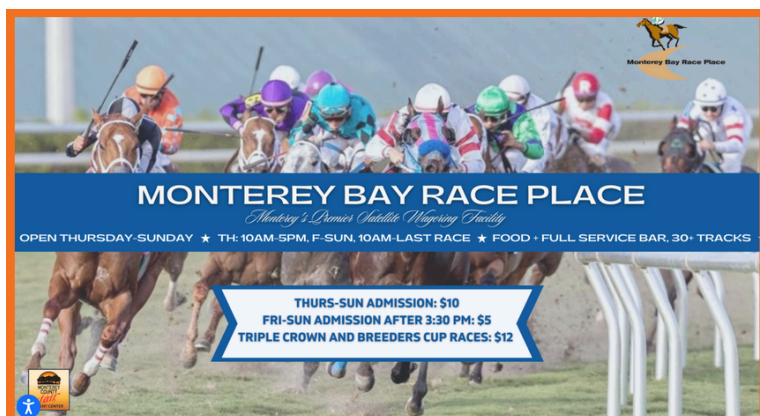
Website Slider Example