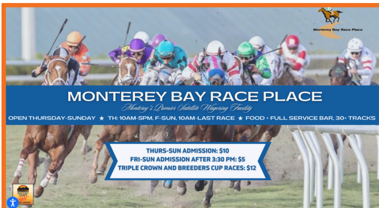
Website Slider Example