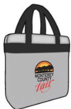
Clear Plastic Bag