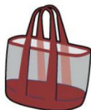
Oversized Tote Bag