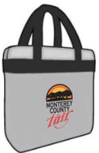
Clear Plastic Bag