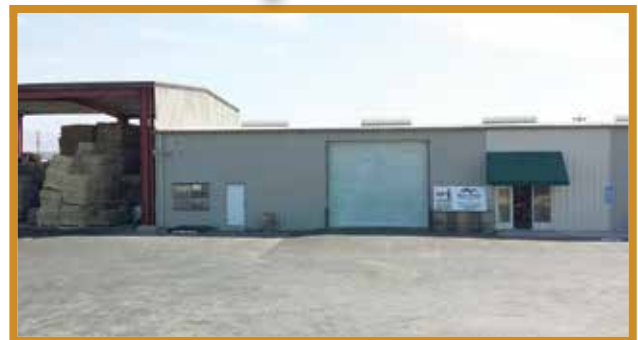
159 Gonzales River Rd., Gonzales (831) 675-0202